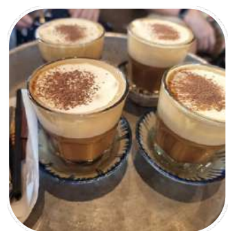
Hanoi Egg Coffee