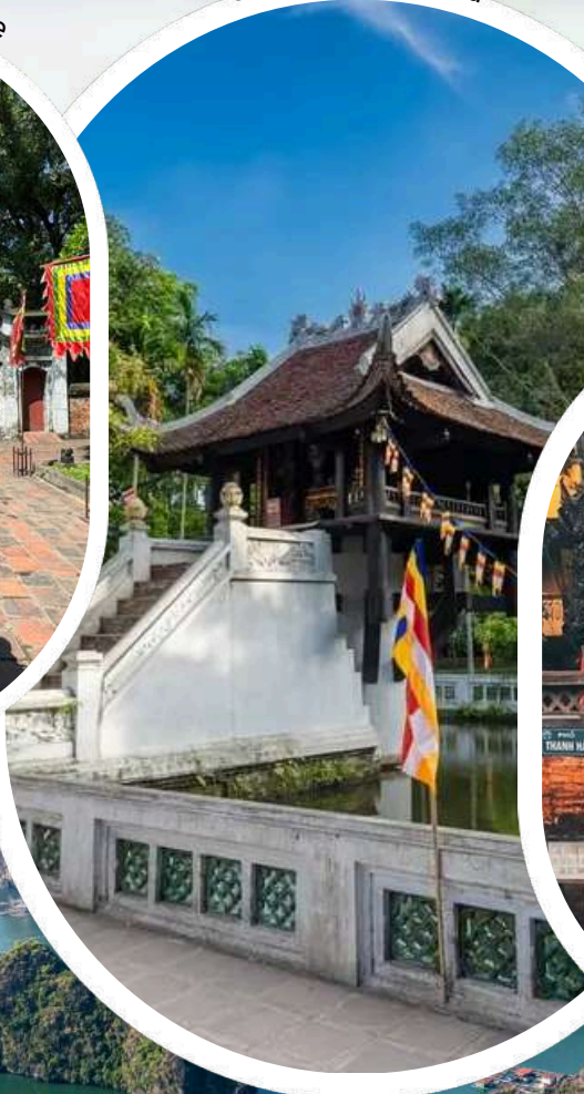
One Pillar Pagoda