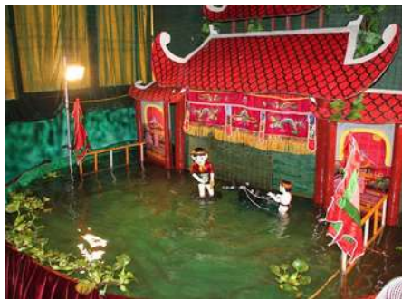
Water Puppet Performance