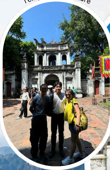
Temple of Literature