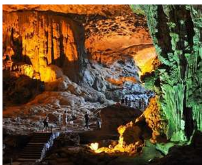
Thien Cung cave

Distance Halong –Hanoi: 165km à 4 hour transfer included break time on the way