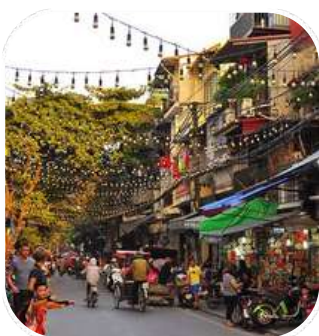
Hanoi Old Quarter

Distance Noi Bai Airport – Hanoi Central: 30 km => 50 minute transfer